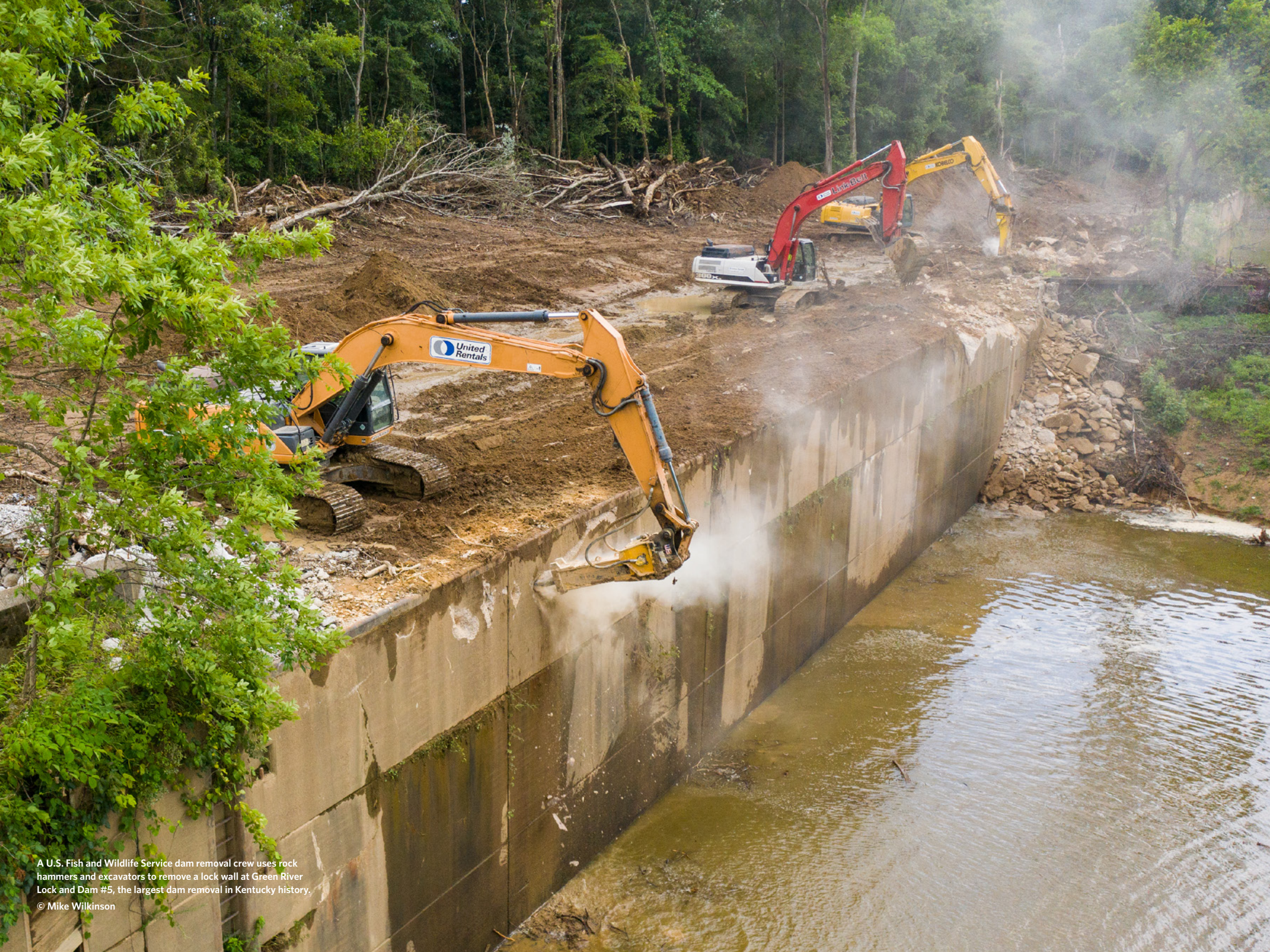
A U.S. Fish and Wildlife Service dam removal crew uses rock hammers and excavators to remove a lock wall at Green River Lock and Dam #5, the largest dam removal in Kentucky history.